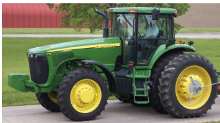
JOHN DEERE 8320 DIESEL