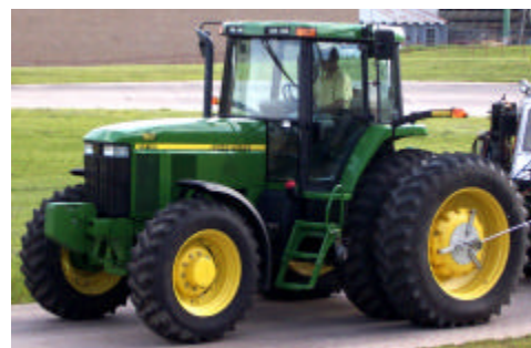
JOHN DEERE 7810 DIESEL