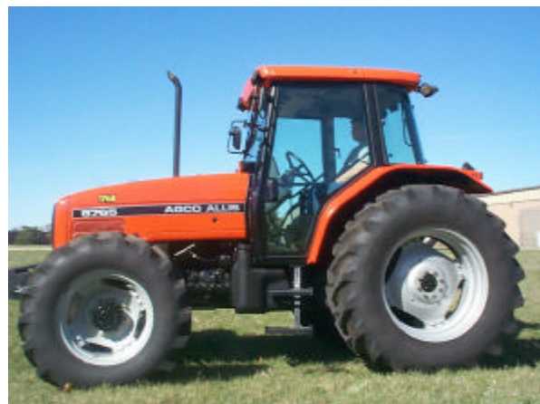
AGCO Allis 8765 Diesel