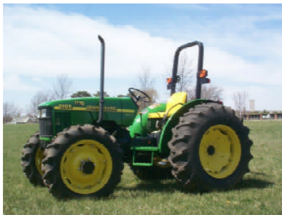
John Deere 5105 Diesel