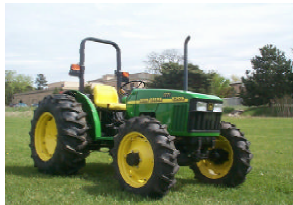
John Deere 5205 Diesel

REPAIRS AND ADJUSTMENTS: No repairs or adjustments