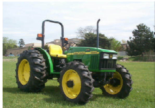
John Deere 5205 Diesel