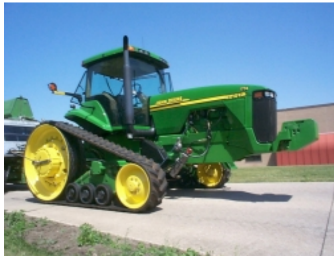
JOHN DEERE 8210T DIESEL