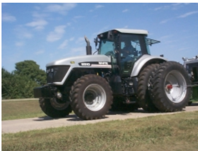
White 8510 Diesel