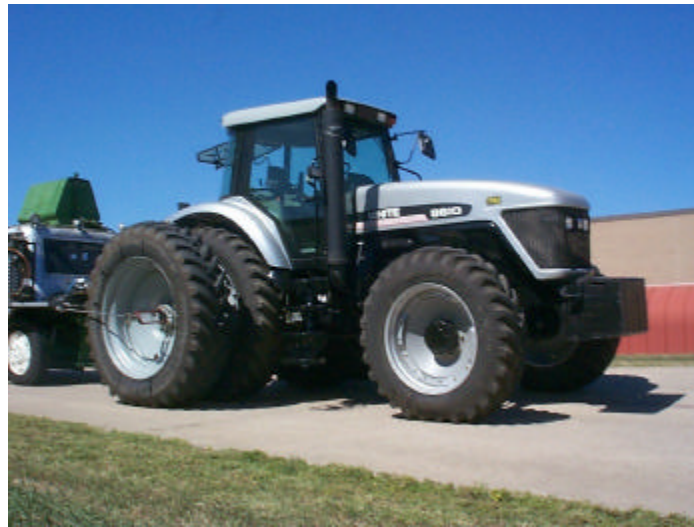
White 8610 Diesel