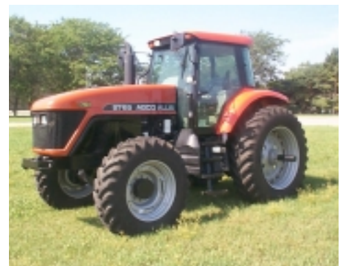
AGCO Allis 9765 Diesel