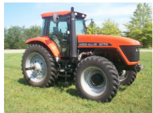
AGCO Allis 9775 Diesel