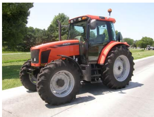
AGCO LT95A Diesel

Institute of Agriculture and Natural Resources University of Nebraska-Lincoln