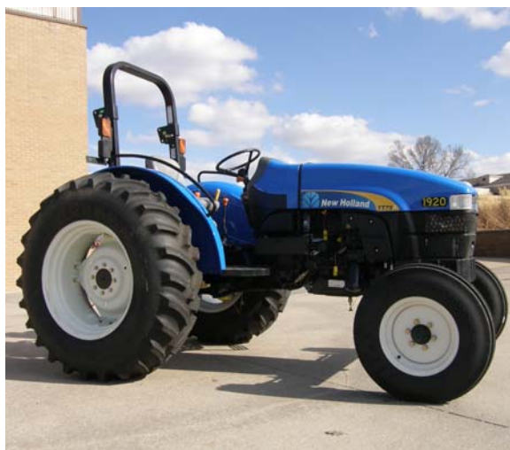
New Holland TT 75A Diesel