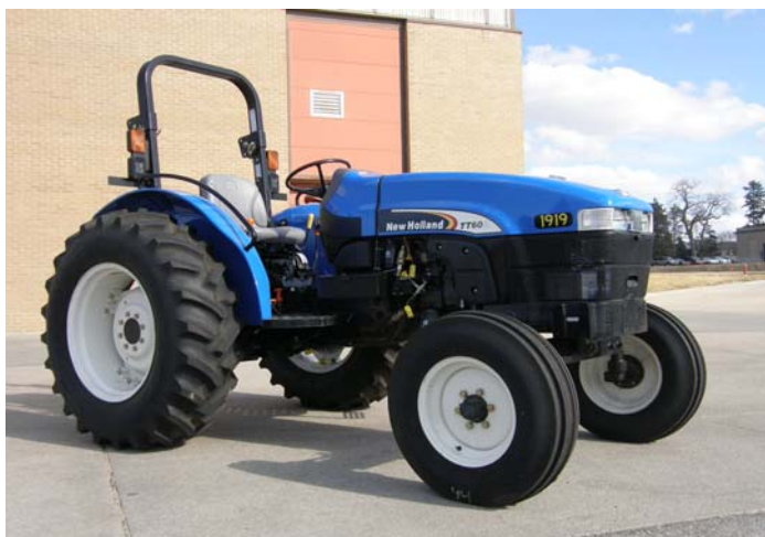
New Holland TT 60A Diesel

Institute of Agriculture and Natural Resources University of Nebraska-Lincoln