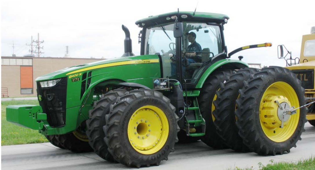
JOHN DEERE 8400R DIESEL