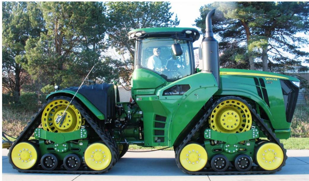
JOHN DEERE 9570RX DIESEL