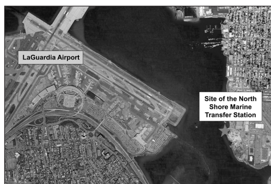
Figure 2. Map showing the location of the LaGuardia Airport and the North Shore Marine Transfer Station, College Point, New York, USA.