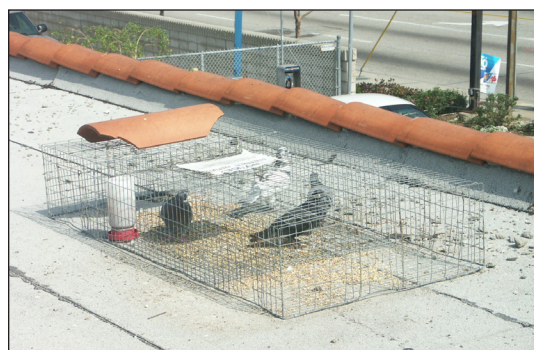
Figure 3. Cage trap used to live-capture rock pigeons ( Columba livia).

operational procedures, DSNY could operate the NSMTS facility with low risk to aircraft operations associated with LaGuardia Airport (LGA; Washburn et al. 2010). The DSNY agreed to implement all of the technical panel's recommendations during the construction and operation of the NSMTS facility.