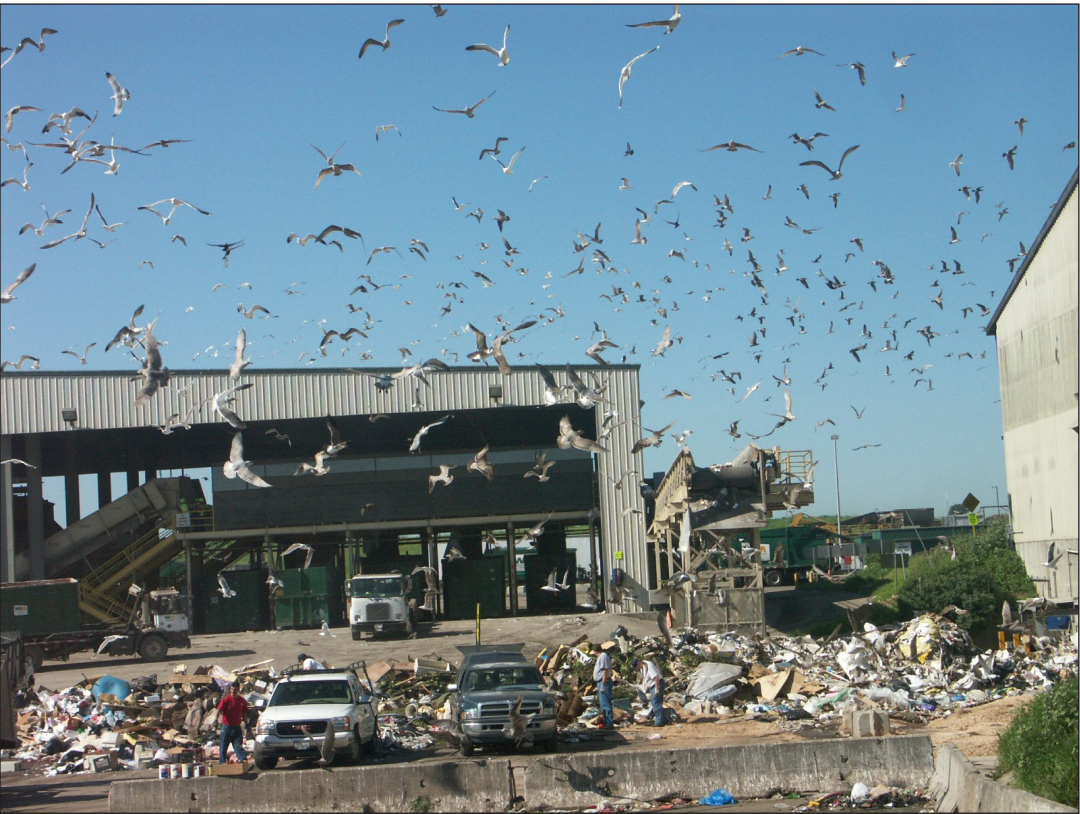
Figure 1. Flock of gulls scavenging at a waste transfer station.