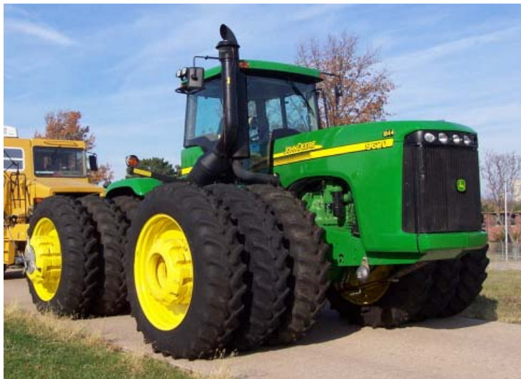
JOHN DEERE 9620 DIESEL