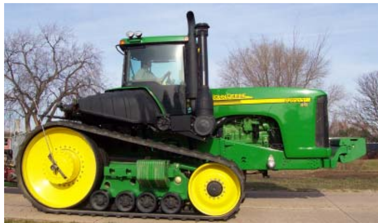
JOHN DEERE 9620T DIESEL