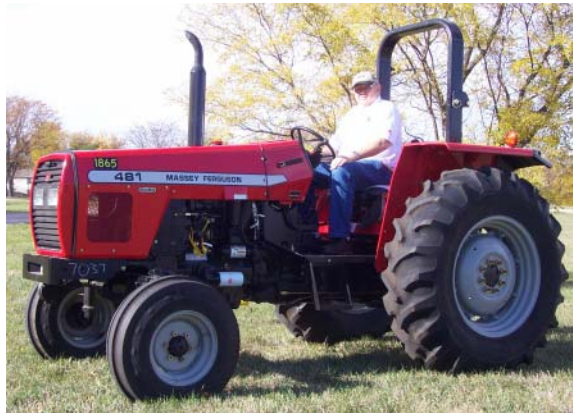
MASSEY FERGUSON 481 Diesel

Institute of Agriculture and Natural Resources University of Nebraska-Lincoln