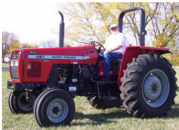
MASSEY FERGUSON 481 Diesel

Institute of Agriculture and Natural Resources University of Nebraska-Lincoln