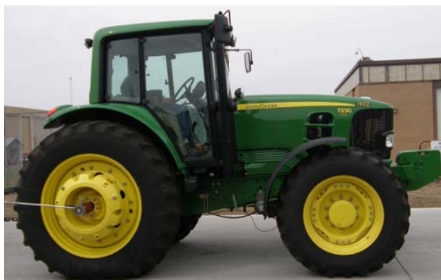
JOHN DEERE 7230 DIESEL

Institute of Agriculture and Natural Resources University of Nebraska–Lincoln