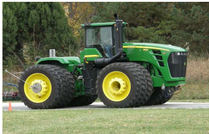
JOHN DEERE 9530 DIESEL