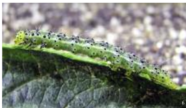
Fig. 6. Live Hypena opulenta larva

Larva. (Figs 6 & 7) Fully grown larvae are 14 to 22 mm in length, green (Fig. 6) and with all major setae of head and body with dark well defined setal bases except those of SV2 of abdominal segments 5 and 6 (Fig. 7).