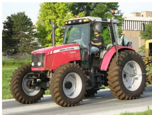
MASSEY FERGUSON 5480 Diesel

Institute of Agriculture and Natural Resources University of Nebraska–Lincoln