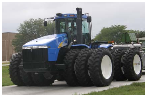
New Holland T9050 Diesel

Institute of Agriculture and Natural Resources University of Nebraska-Lincoln