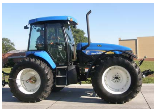
New Holland TV 6070 Diesel

Institute of Agriculture and Natural Resources University of Nebraska-Lincoln