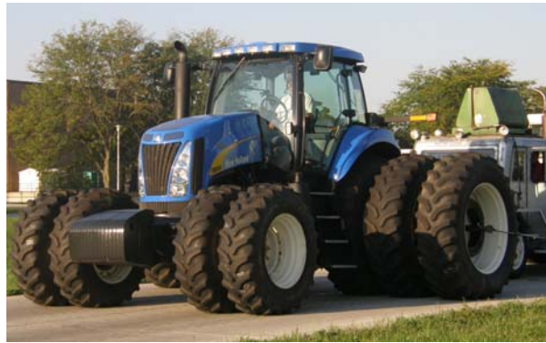
NEW HOLLAND T8050 DIESEL