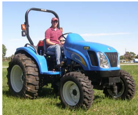
New Holland T2330 Diesel

Institute of Agriculture and Natural Resources University of Nebraska-Lincoln