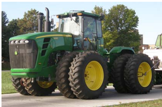
JOHN DEERE 9230 DIESEL

Institute of Agriculture and Natural Resources University of Nebraska-Lincoln