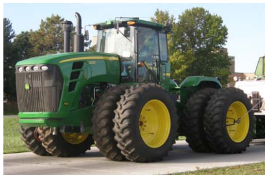
JOHN DEERE 9230 DIESEL