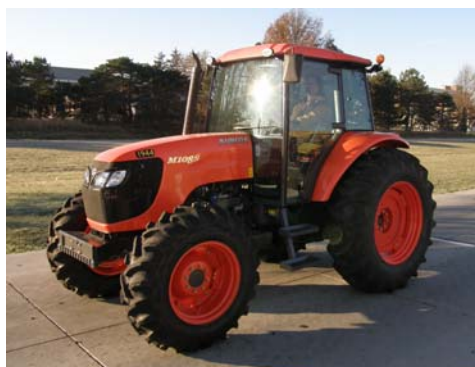
Kubota M108S Diesel

Institute of Agriculture and Natural Resources University of Nebraska-Lincoln