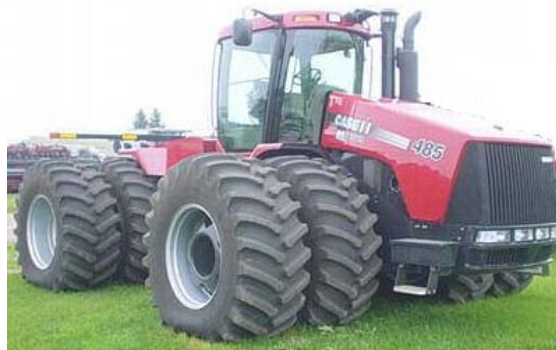
Case IH Steiger 485 Diesel

Institute of Agriculture and Natural Resources University of Nebraska-Lincoln