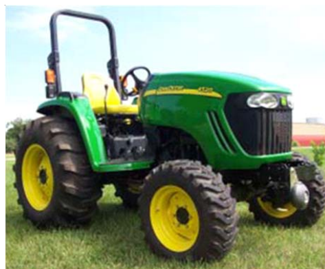
John Deere 4520 Diesel