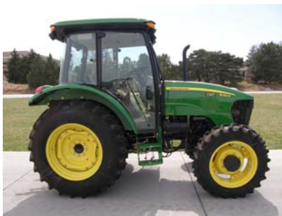
John Deere 5083E Ltd Diesel