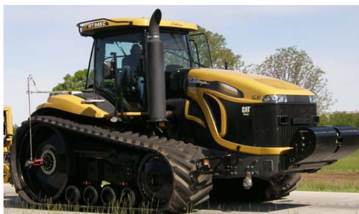
CHALLENGER MT845C DIESEL

Institute of Agriculture and Natural Resources University of Nebraska-Lincoln