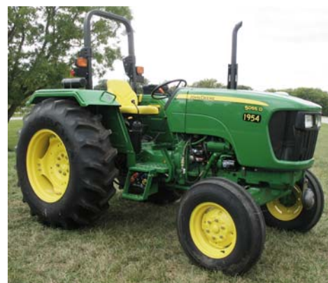
John Deere 5055D Diesel