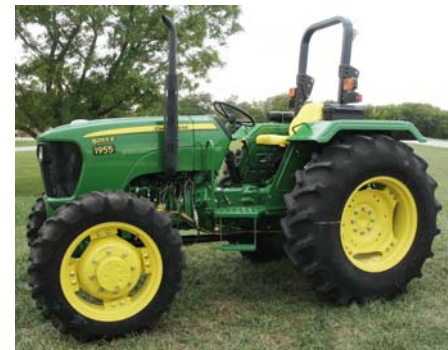
John Deere 5055E Diesel