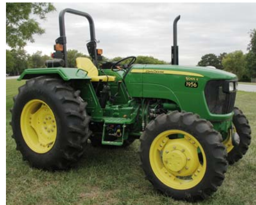
John Deere 5065E Diesel