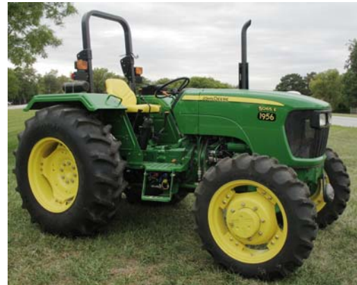
John Deere 5065E Diesel