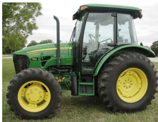
JOHN DEERE 5095M DIESEL