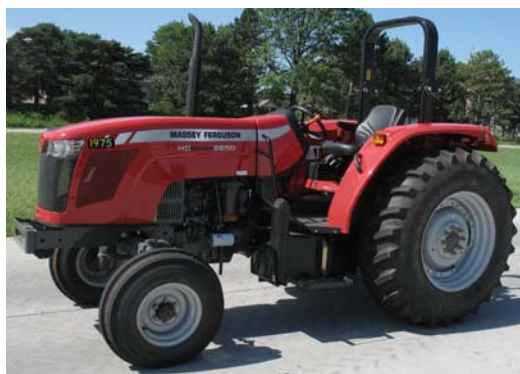
MASSEY FERGUSON 2650HD Diesel

Institute of Agriculture and Natural Resources University of Nebraska-Lincoln