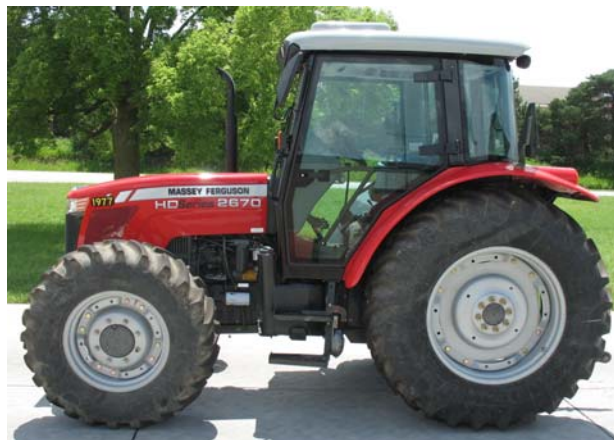
MASSEY FERGUSON 2670HD Diesel

Institute of Agriculture and Natural Resources University of Nebraska-Lincoln