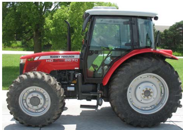
MASSEY FERGUSON 2670HD Diesel