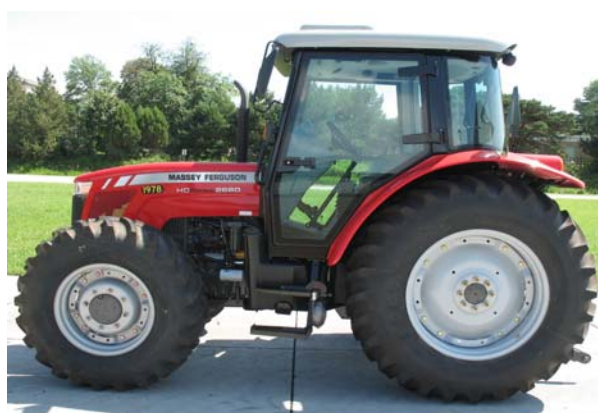
MASSEY FERGUSON 2680HD Diesel