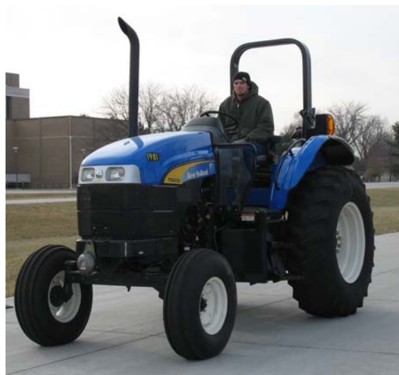
New Holland TS6020 Diesel Institute of Agriculture and Natural Resources University of Nebraska-Lincoln