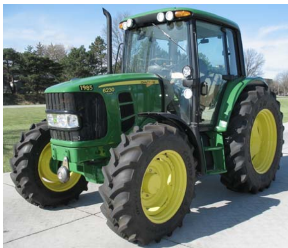
JOHN DEERE 6230 PREMIUM DIESEL Institute of Agriculture and Natural Resources University of Nebraska-Lincoln

Clutch multiple wet disc hydraulically operated by foot pedal Brakes wet disc hydraulically operated by two foot pedals which can be locked together Steering hydrostatic Power take-off 540 rpm at 2143 engine rpm or 1000 rpm at 2220 engine rpm. Unladen tractor mass 10280 lb (4663 kg)