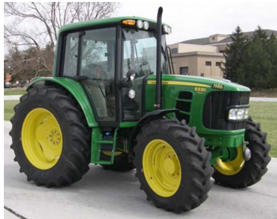
JOHN DEERE 6330 PREMIUM DIESEL Institute of Agriculture and Natural Resources University of Nebraska-Lincoln

Clutch multiple wet disc hydraulically operated by foot pedal Brakes wet disc hydraulically operated by two foot pedals which can be locked together Steering hydrostatic Power take-off 540 rpm at 2143 engine rpm or 1000 rpm at 2220 engine rpm. Unladen tractor mass 10265 lb (4656 kg)