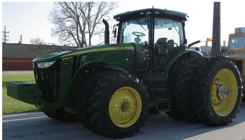
JOHN DEERE 8360R DIESEL