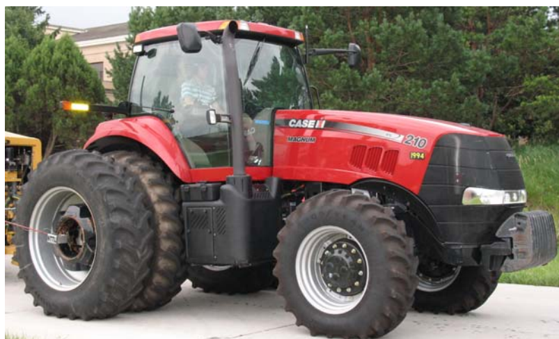
CASE IH MAGNUM 210 DIESEL