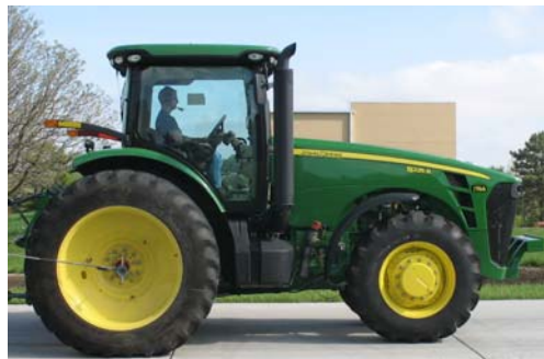
JOHN DEERE 8225R DIESEL

Institute of Agriculture and Natural Resources University of Nebraska–Lincoln