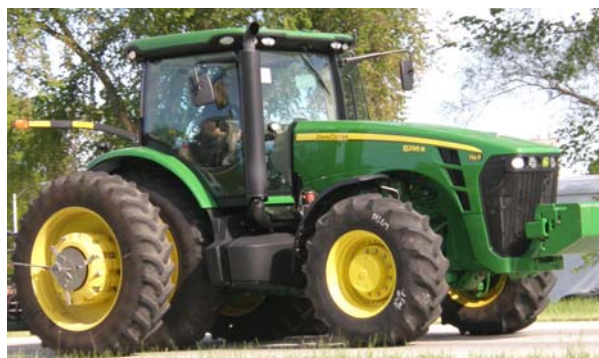
JOHN DEERE 8295R DIESEL