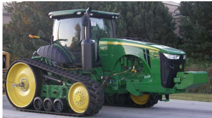
JOHN DEERE 8335RT DIESEL