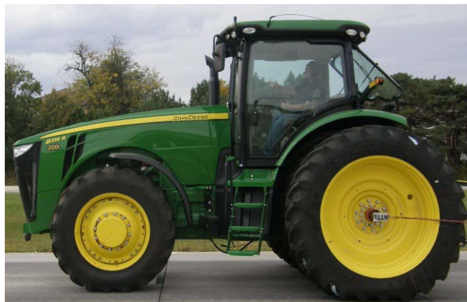
JOHN DEERE 8235R DIESEL