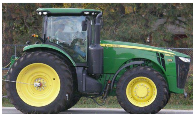
JOHN DEERE 8260R DIESEL